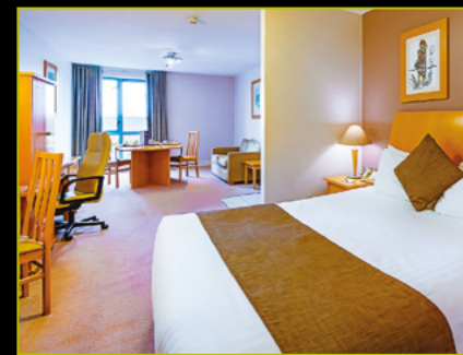
124 SPACIOUS ROOMS 24 LIFESTYLE SUITES