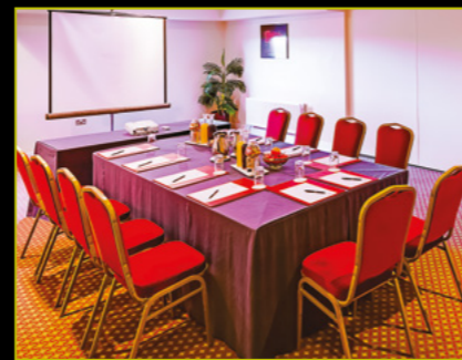
UNBEATABLE LOCATION PARKING FOR 400 VEHICLES