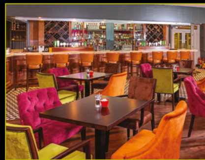
3 DELICIOUS DINING OPTIONS WE PROUDLY SERVE STARBUCKS® COFFEE